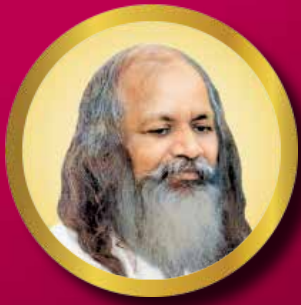
His Holiness Maharishi Mahesh Yogi

mvmtvr2020@gmail.com www.mvmthiruvarur.edu.in