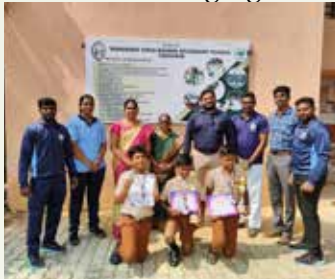
NATIONAL LEVEL AND STATE LEVEL WINNERS IN ARCHERY COMPETITION

Maharishi Vidya Mandir Secondary School Thiruvarur is providing various platform for the children in various fields to achieve. We are always a guiding force for our children to achieve more. Our children are bringing more laurels to school.