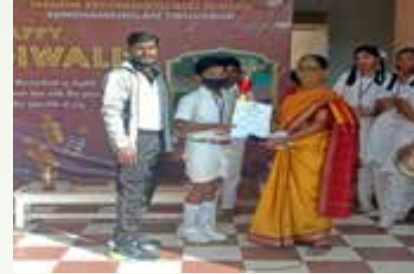
RITISH V - STD STATE LEVEL KARATE - III PLACE