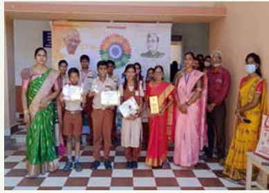
DISTRICT LEVEL CHESS COMPETITION